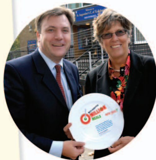
Rt. Hon Ed Balls MP, Secretary of State for Schools and School Food Trust Chair Prue Leith launch the Million Meals campaign.