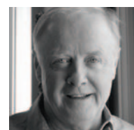
Sir Gerry Robinson