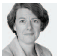
Baroness Sally Morgan of Huyton