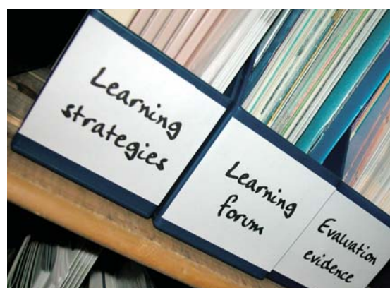
Files on display in a project school

"You can't be growing all the time. There are ebbs and flows: when you get into a new school year; after a few weeks; the beginning of a new term; the end of term tidying up and rewards and satisfaction... There are phases when you have spurts, or when you chill out, or when the waters are distinctly choppy."